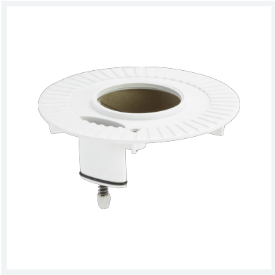
Rotaplex Trio F-Einlaufelement Modell 6145.191